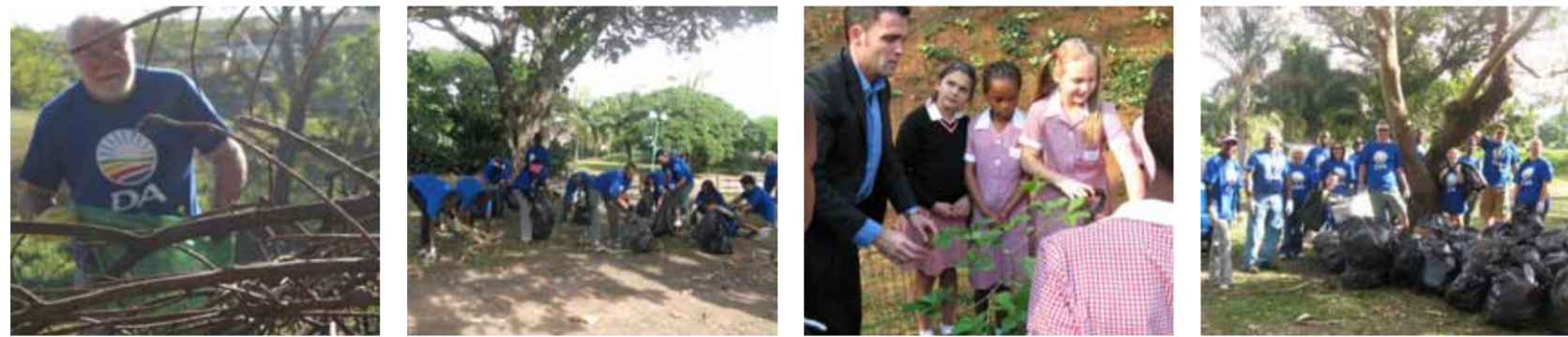
Your local DA public representatives and DA volunteer team have been hard at work greening and cleaning in West Durban.

DA calls for transferable development rights to be explored