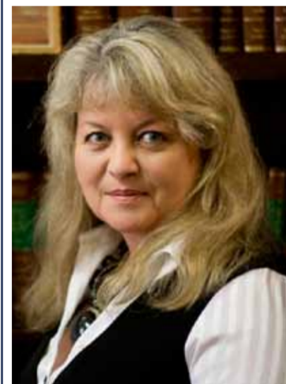
DA Shadow Minister of Police Dianne Kohler-Barnard MP

DA Shadow Minister of Police raises urgent issues